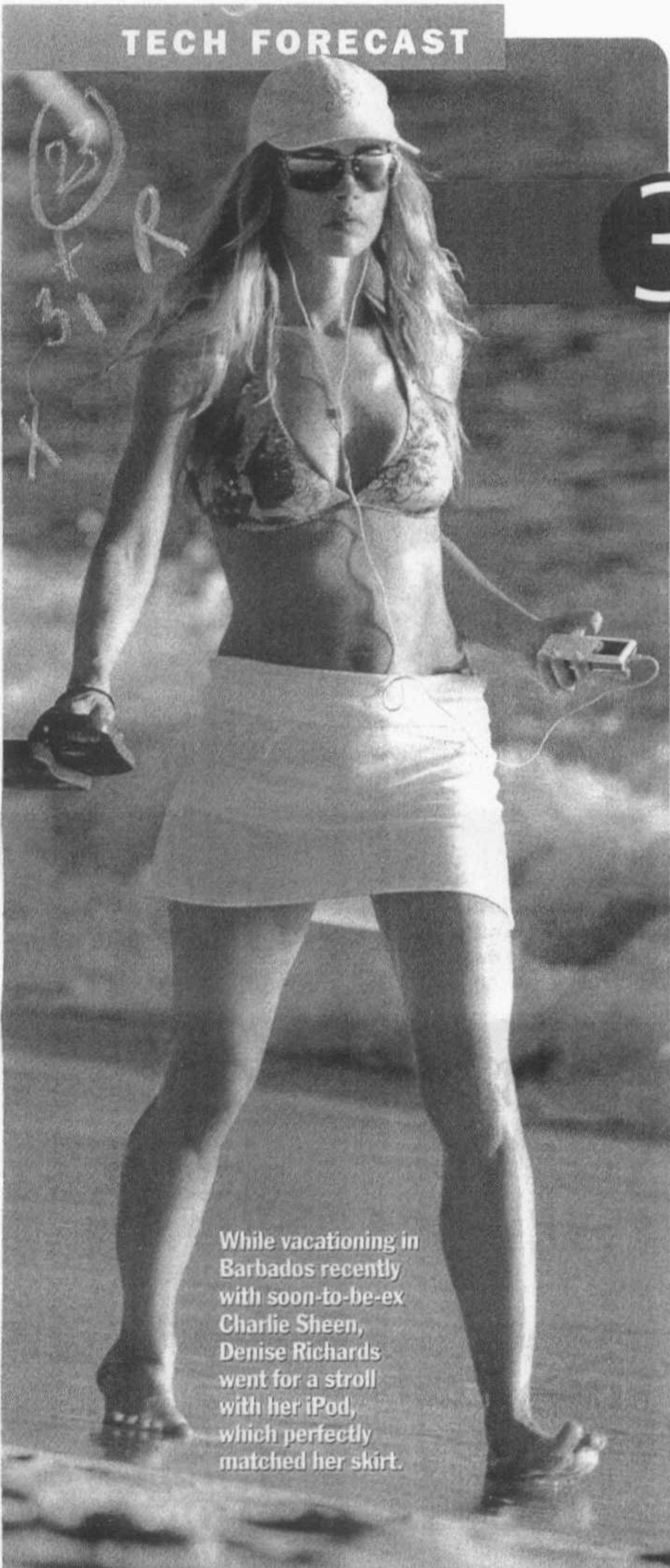
While vacationing in Barbados recently with soon-to-be-ex Charlie Sheen, Denise Richards went for a stroll with her iPod, which perfectly matched her skirt.